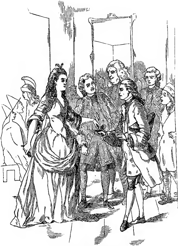
Macbeth and Lady Macbeth.